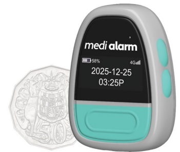
Medi Alarm Nano (2025)