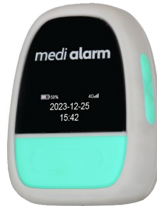
Medi Alarm 4G Pro II (2024)